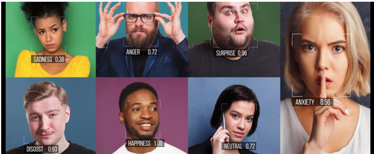
Figure.1: Emotion Recognition