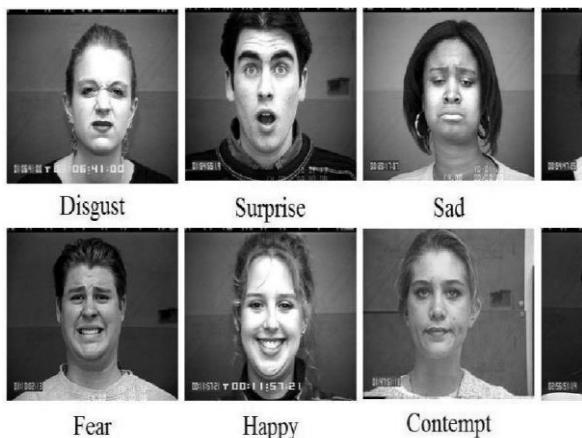
Fig.4: Data Preparation